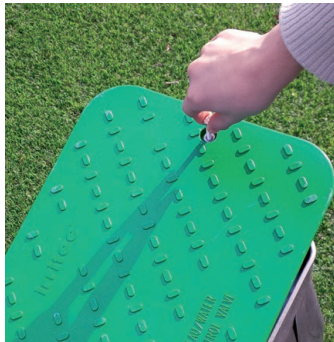
VANDALISM-PROOF BOLT WITH LOCKING NUT IN THE INTERIOR ACTS AS THE HANDLE TO LIFT THE COVER.